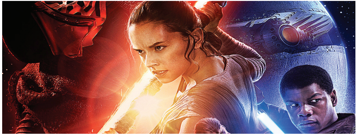
An official poster for Episode VII, featuring all new characters, such as Finn and Rey