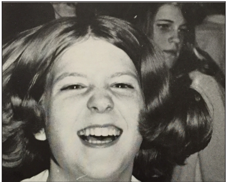
When you take too candid of a photo with your selfie stick.