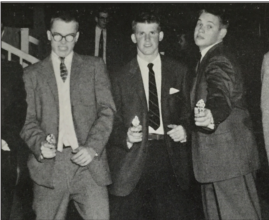
When you know NT will take your props away.