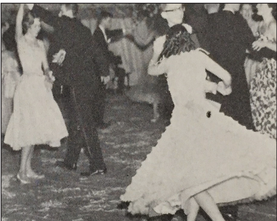
The awkward underclassmen who are way too dressed up.