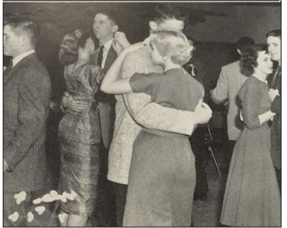
The overly affectionate couple in the center of the dance floor.