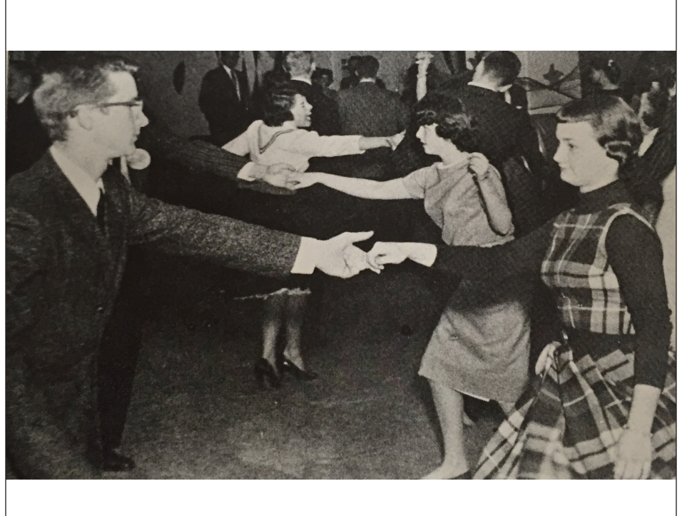
When your date is a bad dancer.