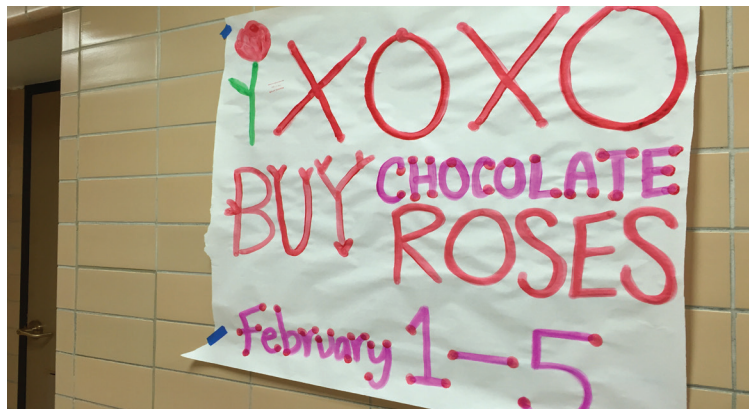
Buying classmates chocolate roses is just one way NT celebrates | Zhang

NT students have mixed feelings over Valentine's Day's