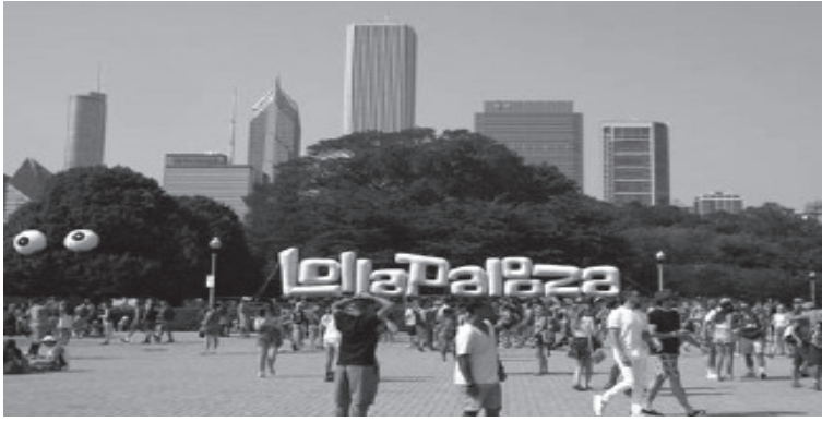
Lollapalooza was held in Grant Park August 1, 2, 3