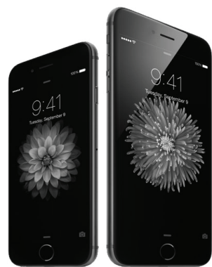
Apple announced the iPhone 6 and the new iWatch on Tuesday | Apple

Both phones will be operating on the brand new iOS 8 software designed specifically to excel on the