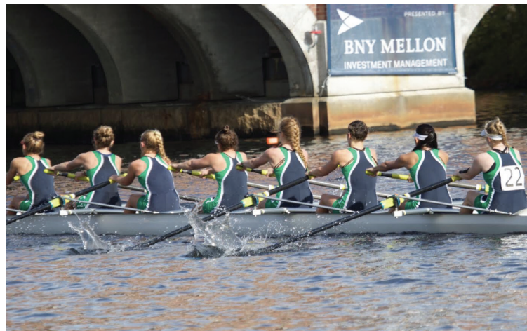
The girls varsity eight rowing at the regatta

The Trevians also felt they rowed well on the girls’ side of the competition. While the girls’ varsity