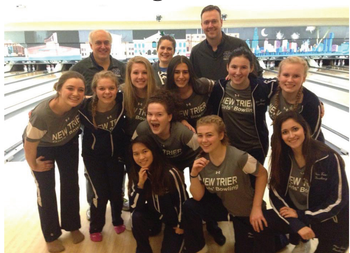
New Trier Girls Bowling after their third place finish at sectionals in Rolling Meadows on Feb. 13

The team advanced to sectionals for the second time in its history