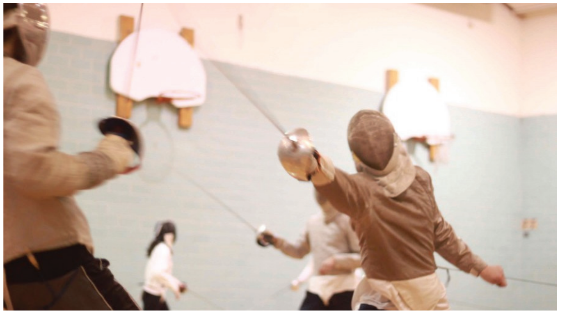
The Trevians will be one of the top teams in the Great Lakes Conference once again this year