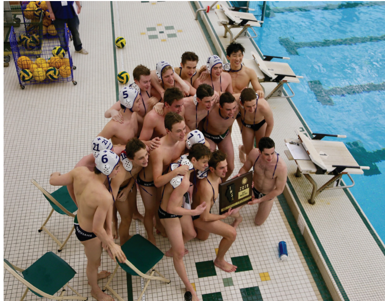
NTBWP holds sectional plaque, earned by defeating ETHS | B. Water Polo