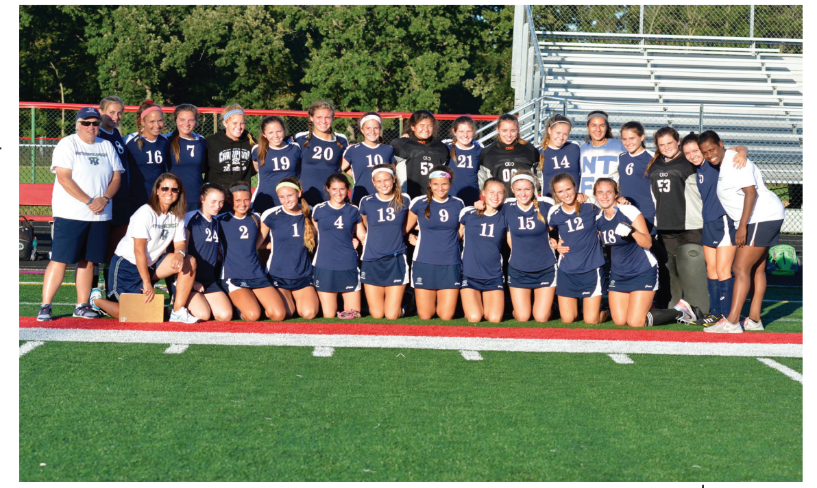
The girls varsity field hockey team is made up of one sophomore, thirteen juniors, and eleven seniors

team finished with a winning record, beating most teams at the St. Louis tournament. Last year, they were the IHSA state champions, winning their 11th state championship. But with each new season comes a new team.