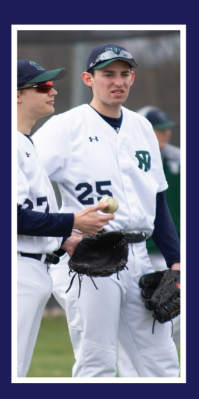
Threw 5 scoreless innings, picked up 4 Ks to shut out Barrington