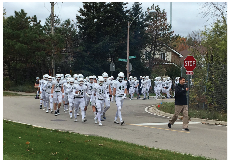
The team marches from NT to meet Loyola at Hoerster Field

"We were all excited. We knew how important this game was and knew the environment was going to