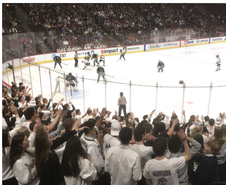
NT looks to defend their net in front of a packed UC house | Fenwick Twitter

"The atmosphere at the United Center was really exciting and