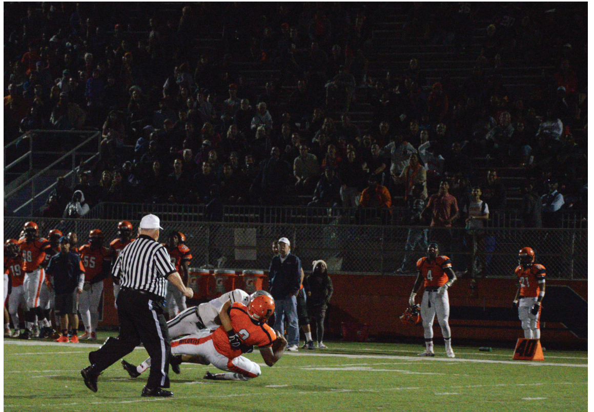
New Trier's defense was dominant during a 14-12 win. They haven't lost to Evanston since 2010