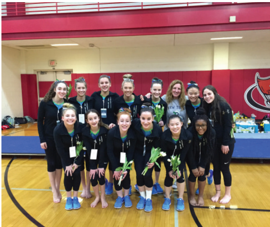
New Trier girls gymnastics celebrate finishing fourth overall in the state championship on Feb. 17

“She landed a beautiful vault and scored a 9.6. It was crazy because