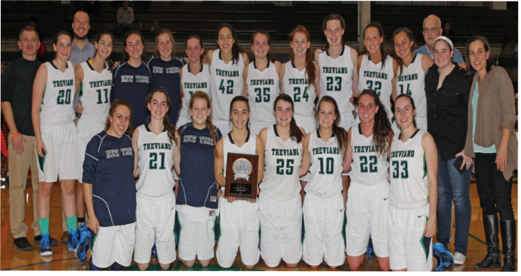
The girls team after its win at the Thanksgiving Tournament

went on a 12-2 run and took a 16-14 lead with 1:03 left in the first quarter. They wouldn't look back.